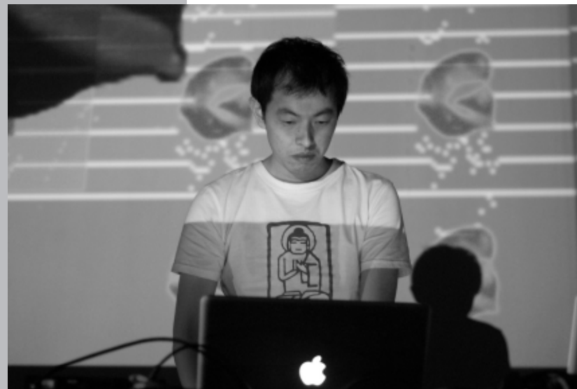
Warsaw Electronic Festival 2010 Poland

8th Shanghai Biennale(2010,Shanghai,CN) Big Big Rice(2010,Foshan,CN) Sound Reach(2009,Toronto,CA) RED_Shift(2009,Shenzhen,CN) Shenzhen & Hong Kong Bi-city Biennale of Urbanism \ Architecture (2007,Shenzhen,CN) Get It Louder(2007,Guangzhou,CN) Listen up:When the Plug is ON(2007,Hong Kong,CN)